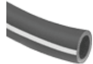
Low Pressure Grease Filled Tubing PN: 21999-0433-GF