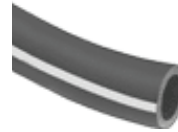
Low Pressure Tubing PN: 21999-0433